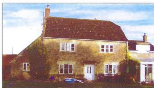
Church Farm in 2011, with late C18 and mid C19 additions