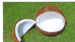
Coconut – protein and essential oils