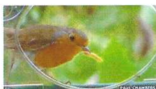
Mealworms – live or dried, full of protein

As well as making sure your feeders are kept topped up with the usual mixed seed, peanuts and sunflower seeds, you might want to try a few extra tasty snacks too (but please never put out desiccated coconut).