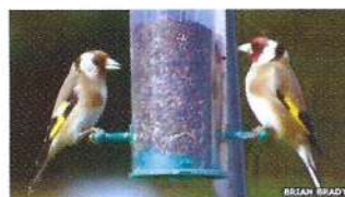
Niger seed – high in fat for warmth and energy