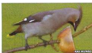
Fruit - high water content, sugar-rich